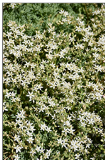
Dwarf Spanish Stonecrop flowers