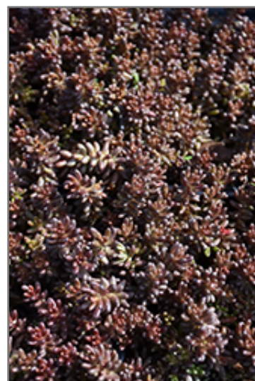
Murale Stonecrop foliage