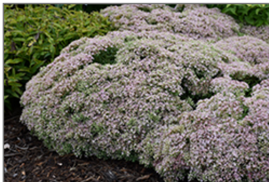
Rock 'N Round Pure Joy Stonecrop in bloom

Rock 'N Round Pure Joy Stonecrop is recommended for the following landscape applications;