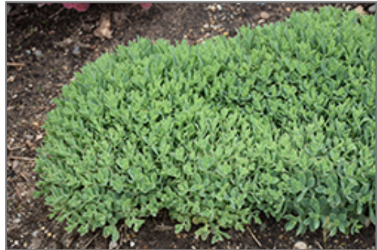
Rock 'N Round Pure Joy Stonecrop

Rock 'N Round Pure Joy Stonecrop will grow to be about 10 inches tall at maturity, with a spread of 15 inches. When grown in masses or used as a bedding plant, individual plants should be spaced approximately 12 inches apart. Its foliage tends to remain low and dense right to the ground. It grows at a fast rate, and under ideal conditions can be expected to live for approximately 15 years. As an herbaceous perennial, this plant will usually die back to the crown each winter, and will regrow from the base each spring. Be careful not to disturb the crown in late winter when it may not be readily seen!