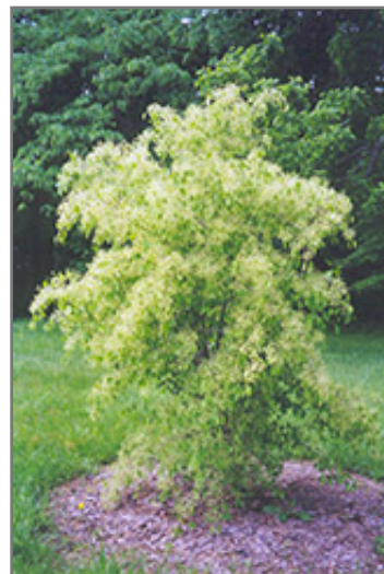
Maack's Spindle Tree in bloom