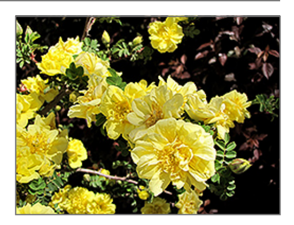
Flore Pleno Rose flowers