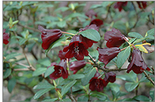
Sanguineum Rhododendron flowers

A compact variety with small dark green foliage, and deep red flowers that tend to nod gracefully; blooms in late spring or early summer; absolutely must have well-drained, highly acidic and organic soil, use plenty of peat moss when planting