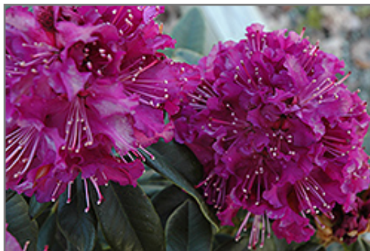
Purpureum Grandiflorum Rhododendron flowers

Purpureum Grandiflorum Rhododendron will grow to be about 8 feet tall at maturity, with a spread of 8 feet. It tends to be a little leggy, with a typical clearance of 1 foot from the ground, and is suitable for planting under power lines. It grows at a slow rate, and under ideal conditions can be expected to live for 40 years or more.