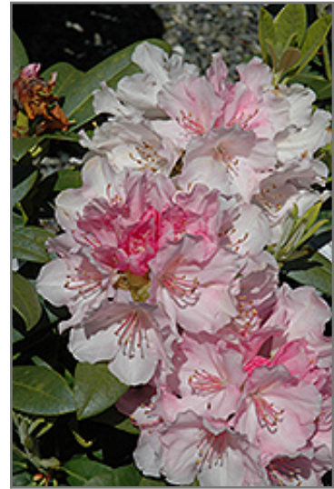
Yaku Angel Rhododendron flowers

Yaku Angel Rhododendron will grow to be about 3 feet tall at maturity, with a spread of 4 feet. It has a low canopy. It grows at a slow rate, and under ideal conditions can be expected to live for 50 years or more.