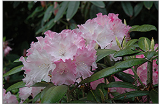
Harold Johnson Rhododendron flowers

A captivating variety with large ruffled shell pink blooms with darker pink edges in mid spring; outstanding as a garden accent; absolutely must have well-drained, highly acidic and organic soil, use plenty of peat moss when planting