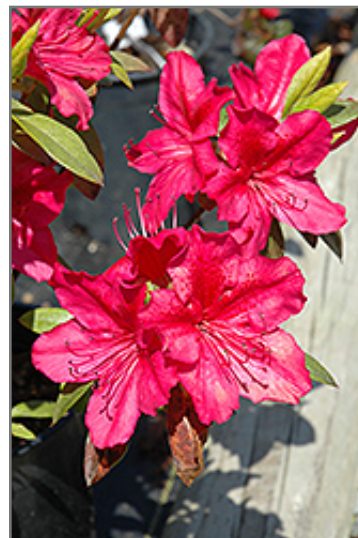
Georg Arends Azalea flowers

Georg Arends Azalea will grow to be about 4 feet tall at maturity, with a spread of 4 feet. It tends to be a little leggy, with a typical clearance of 1 foot from the ground. It grows at a slow rate, and under ideal conditions can be expected to live for 40 years or more.