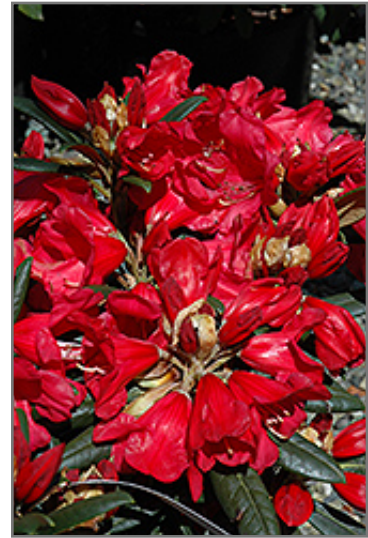
Fred Peste Rhododendron flowers

Fred Peste Rhododendron will grow to be about 4 feet tall at maturity, with a spread of 4 feet. It tends to be a little leggy, with a typical clearance of 1 foot from the ground. It grows at a slow rate, and under ideal conditions can be expected to live for 40 years or more.