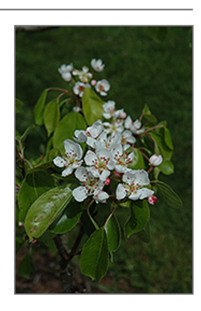
Red Morettini Pear flowers

This is a dense deciduous tree with a more or less rounded form. Its average texture blends into the landscape, but can be balanced by one or two finer or coarser trees or shrubs for an effective composition. This is a high maintenance plant that will require regular care and upkeep, and is best pruned in late winter once the threat of extreme cold has passed. Gardeners should be aware of the following characteristic(s) that may warrant special consideration;