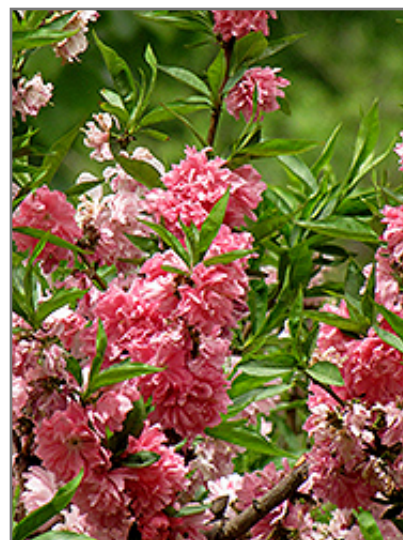
Klara Meyer Flowering Peach flowers

Klara Meyer Flowering Peach is recommended for the following landscape applications;