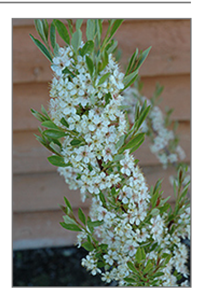
Pawnee Buttes Western Sandcherry flowers

Pawnee Buttes Western Sandcherry is recommended for the following landscape applications;