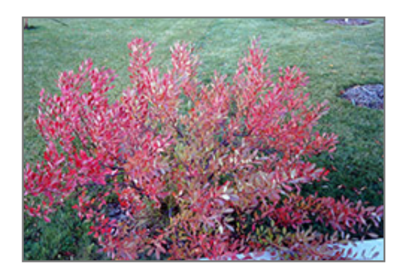
Pawnee Buttes Western Sandcherry in fall