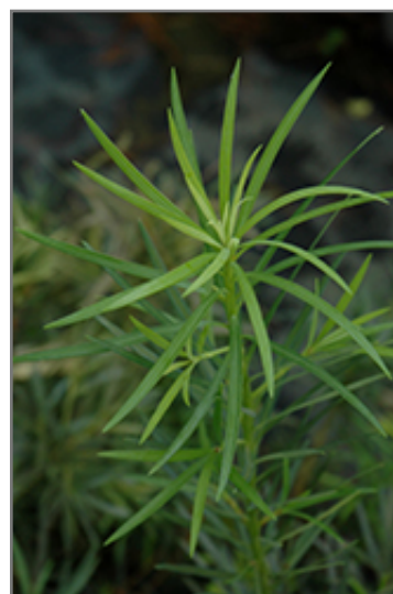
Shrubby Podocarpus foliage