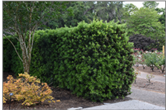
Shrubby Podocarpus

This plant is not reliably hardy in our region, and certain restrictions may apply; contact the store for more information.