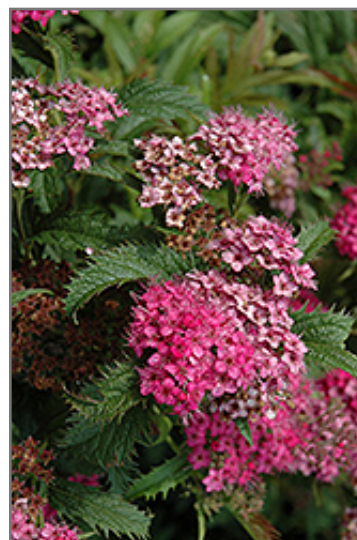
Crispa Spirea flowers