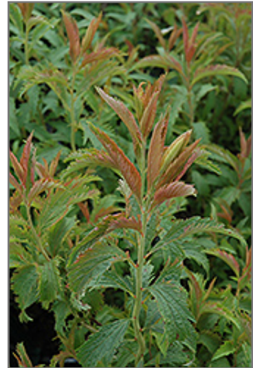
Crispa Spirea foliage

This plant is not reliably hardy in our region, and certain restrictions may apply; contact the store for more information.