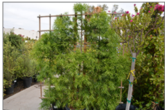
African Fern Pine (topiary form)