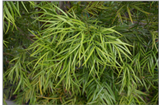
African Fern Pine foliage

African Fern Pine is recommended for the following landscape applications;