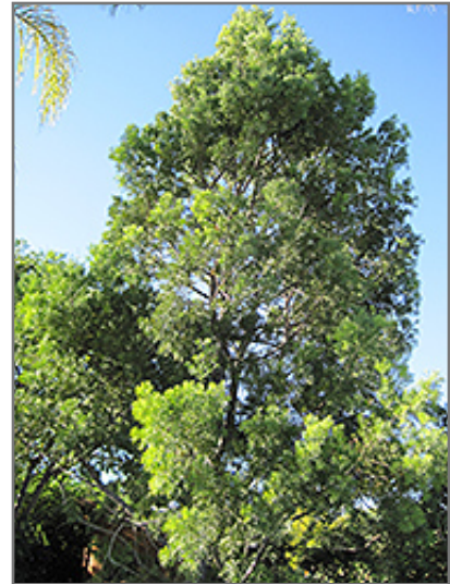
African Fern Pine

This plant is not reliably hardy in our region, and certain restrictions may apply; contact the store for more information.