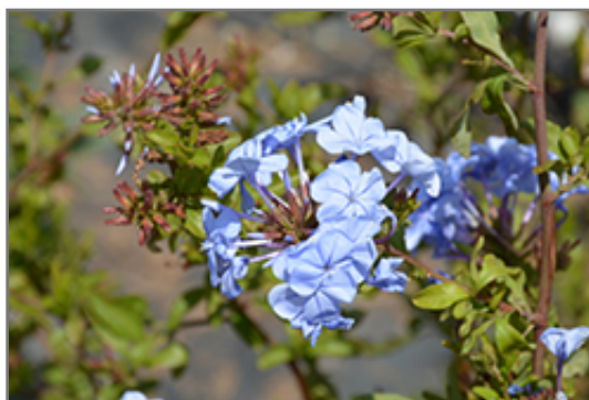
Imperial Blue Plumbago flowers