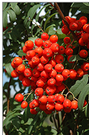
Pyramidal Mountain Ash fruit