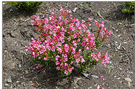
Coppelia Phylliopsis in bloom