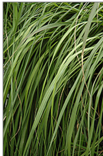
Red Bunny Tails Fountain Grass foliage