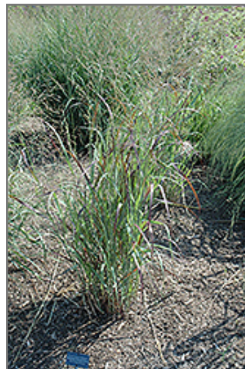
Badlands Switch Grass