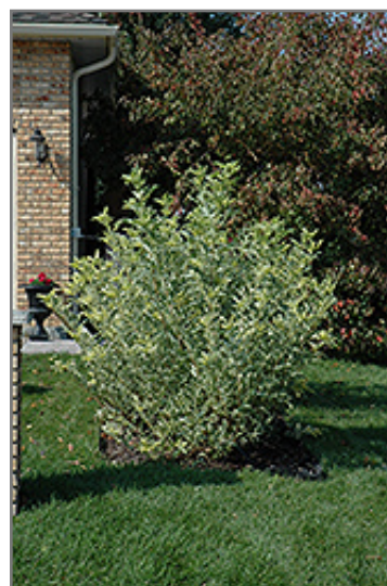
Madonna Elder