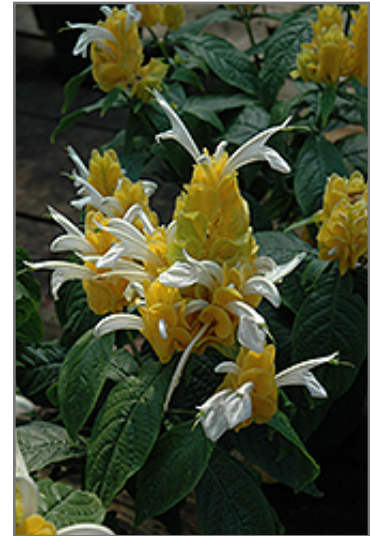
Golden Shrimp Plant flowers