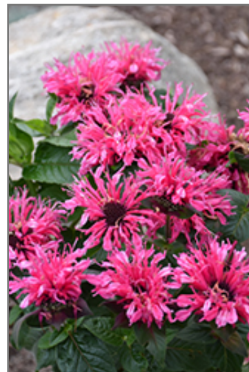
Cranberry Lace Beebalm flowers

Cranberry Lace Beebalm is recommended for the following landscape applications;