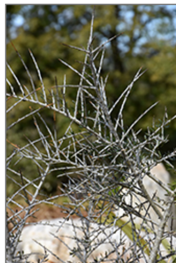
Narrow-leafed Mahoe foliage