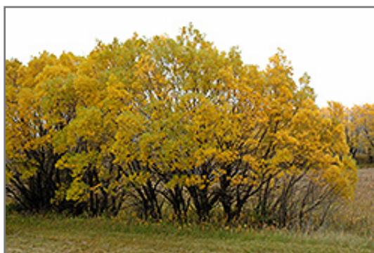
Chermesina White Willow in fall