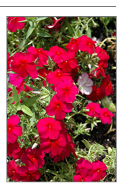
Phloxy Lady Cherry Red Annual Phlox flowers

Phloxy Lady Cherry Red Annual Phlox will grow to be about 12 inches tall at maturity, with a spread of 12 inches. When grown in masses or used as a bedding plant, individual plants should be spaced approximately 10 inches apart. Its foliage tends to remain dense right to the ground, not requiring facer plants in front. This fast-growing annual will normally live for one full growing season, needing replacement the following year.