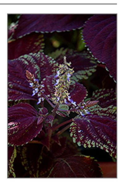
Emotions Sophisticated Coleus foliage

Emotions Sophisticated Coleus will grow to be about 3 feet tall at maturity, with a spread of 30 inches. When grown in masses or used as a bedding plant, individual plants should be spaced approximately 24 inches apart. Although it's not a true annual, this fast-growing plant can be expected to behave as an annual in our climate if left outdoors over the winter, usually needing replacement the following year. As such, gardeners should take into consideration that it will perform differently than it would in its native habitat.