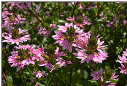
Bombay Pink Fan Flower flowers

Bombay Pink Fan Flower is recommended for the following landscape applications;