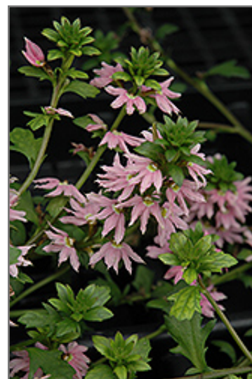
Bombay Pink Fan Flower flowers