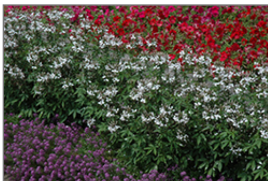
Senorita Blanca Spiderflower in bloom