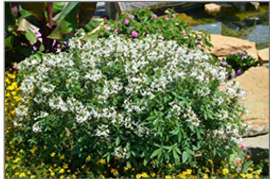
Senorita Blanca Spiderflower in bloom

Senorita Blanca Spiderflower is a fine choice for the garden, but it is also a good selection for planting in outdoor containers and hanging baskets. With its upright habit of growth, it is best suited for use as a 'thriller' in the 'spiller-thriller-filler' container combination; plant it near the center of the pot, surrounded by smaller plants and those that spill over the edges. It is even sizeable enough that it can be grown alone in a suitable container. Note that when growing plants in outdoor containers and baskets, they may require more frequent waterings than they would in the yard or garden.