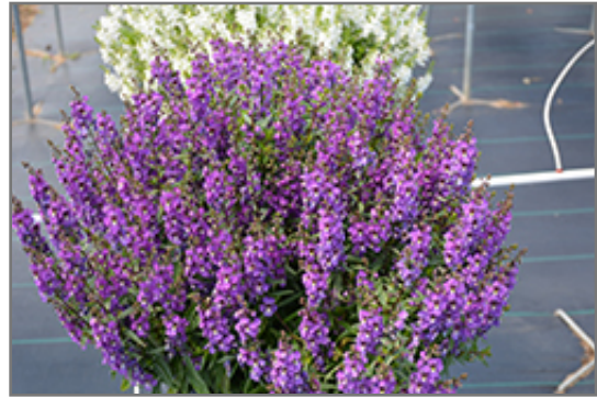
Serenita Purple Angelonia in bloom