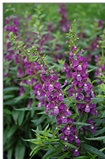
Serenita Purple Angelonia flowers