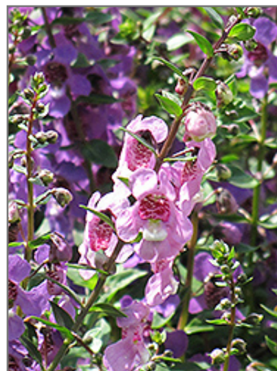
Serena Lavender Pink Angelonia flowers