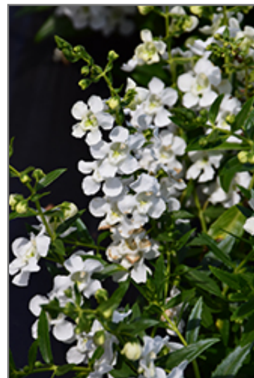
AngelMist Spreading White Angelonia flowers

AngelMist Spreading White Angelonia is recommended for the following landscape applications;