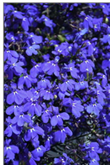
Techno Blue Lobelia flowers

Techno Blue Lobelia is recommended for the following landscape applications;