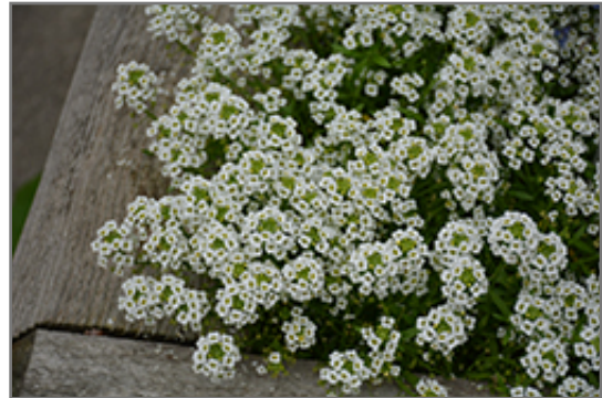
Snow Princess Alyssum flowers