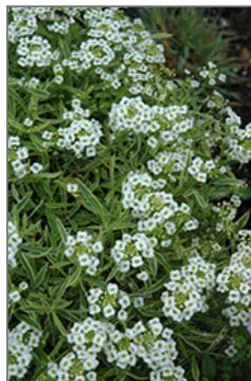
Frosty Knight Alyssum flowers

Frosty Knight Alyssum is recommended for the following landscape applications;