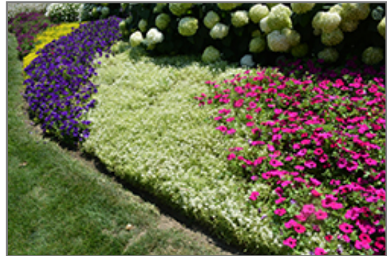
Frosty Knight Alyssum in bloom

Frosty Knight Alyssum will grow to be only 6 inches tall at maturity, with a spread of 18 inches. When grown in masses or used as a bedding plant, individual plants should be spaced approximately 15 inches apart. Its foliage tends to remain low and dense right to the ground. This fast-growing annual will normally live for one full growing season, needing replacement the following year.