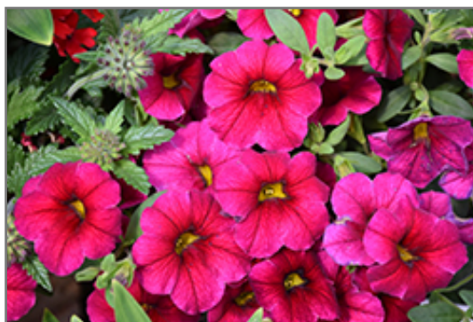
Superbells Cherry Red Calibrachoa flowers