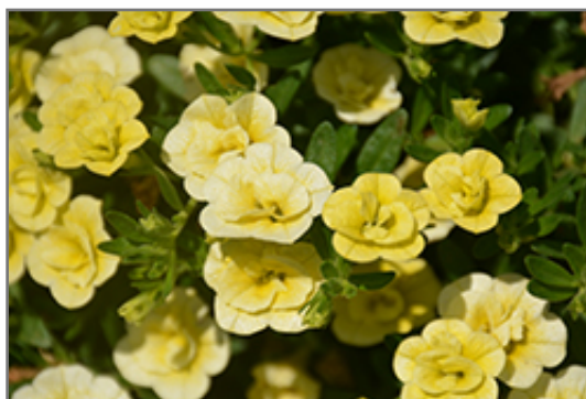
MiniFamous Double Lemon Calibrachoa flowers

MiniFamous Double Lemon Calibrachoa is recommended for the following landscape applications;