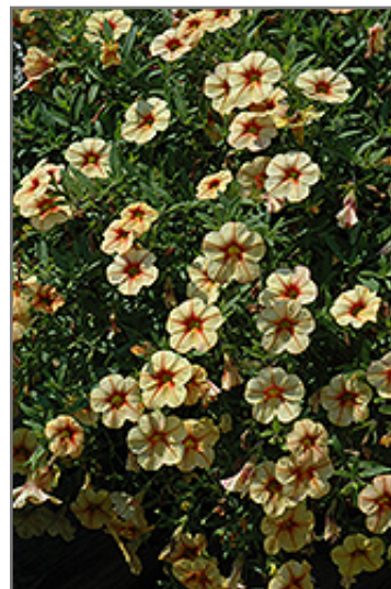
Celebration Peach Cobbler Calibrachoa flowers

Celebration Peach Cobbler Calibrachoa is recommended for the following landscape applications;