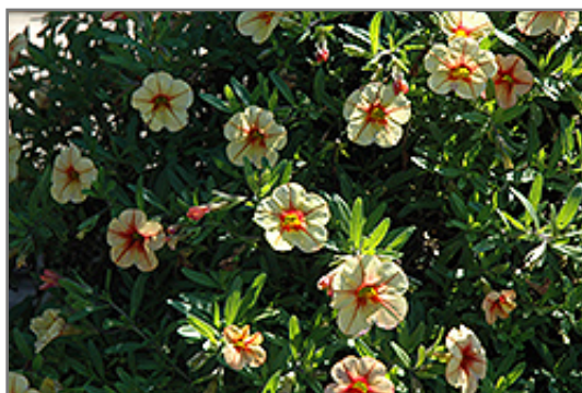
Celebration Peach Cobbler Calibrachoa flowers