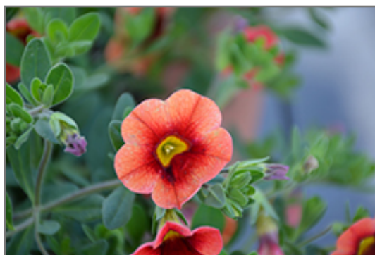
Celebration Mandarin Calibrachoa flowers