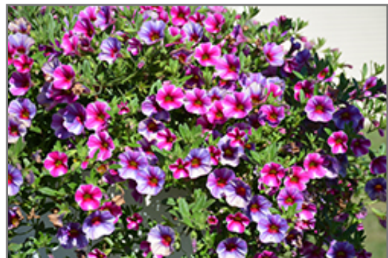
Can-Can Hot Pink Star Calibrachoa flowers