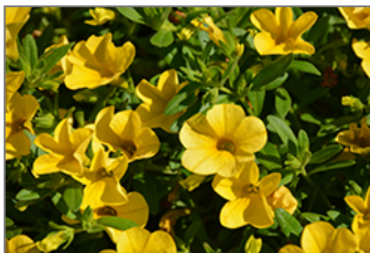
Cabaret Deep Yellow Calibrachoa flowers