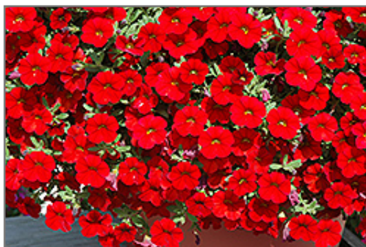
Cabaret Bright Red Calibrachoa flowers

Cabaret Bright Red Calibrachoa is recommended for the following landscape applications;