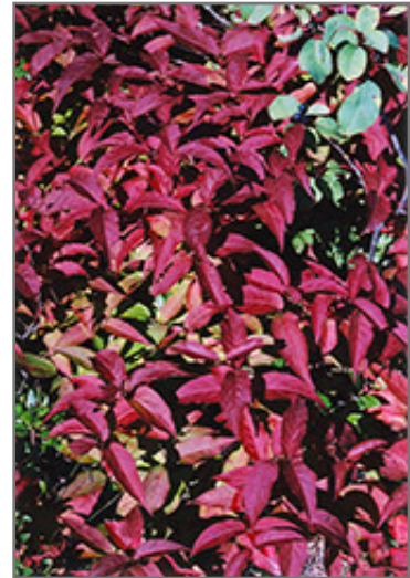
Bush Honeysuckle in fall

This shrub does best in full sun to partial shade. It is very adaptable to both dry and moist locations, and should do just fine under average home landscape conditions. It is not particular as to soil type or pH. It is highly tolerant of urban pollution and will even thrive in inner city environments. This species is native to parts of North America.