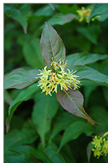
Bush Honeysuckle flowers