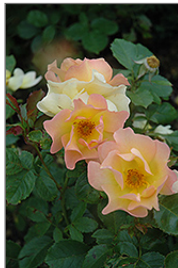
Morden Sunrise Rose flowers

Morden Sunrise Rose is recommended for the following landscape applications;