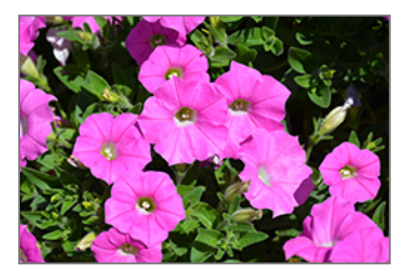
Shock Wave Pink Shades Petunia flowers