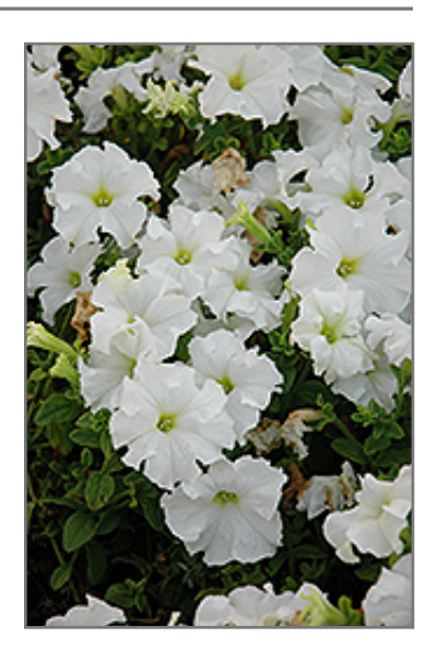
Paparazzi White Diamonds Petunia flowers

Paparazzi White Diamonds Petunia will grow to be about 12 inches tall at maturity, with a spread of 14 inches. When grown in masses or used as a bedding plant, individual plants should be spaced approximately 12 inches apart. Its foliage tends to remain dense right to the ground, not requiring facer plants in front. This fast-growing annual will normally live for one full growing season, needing replacement the following year.