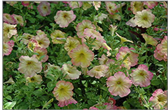
Debonair Dusty Rose Petunia flowers