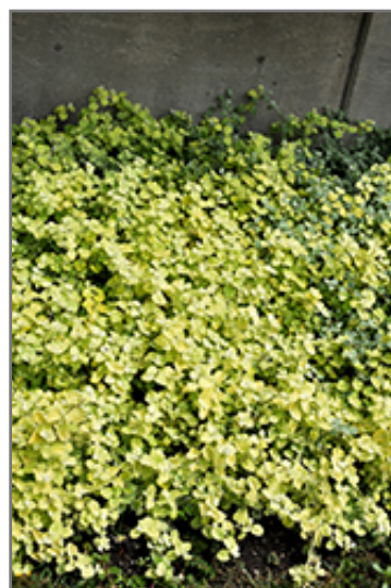
Lemon Licorice Plant